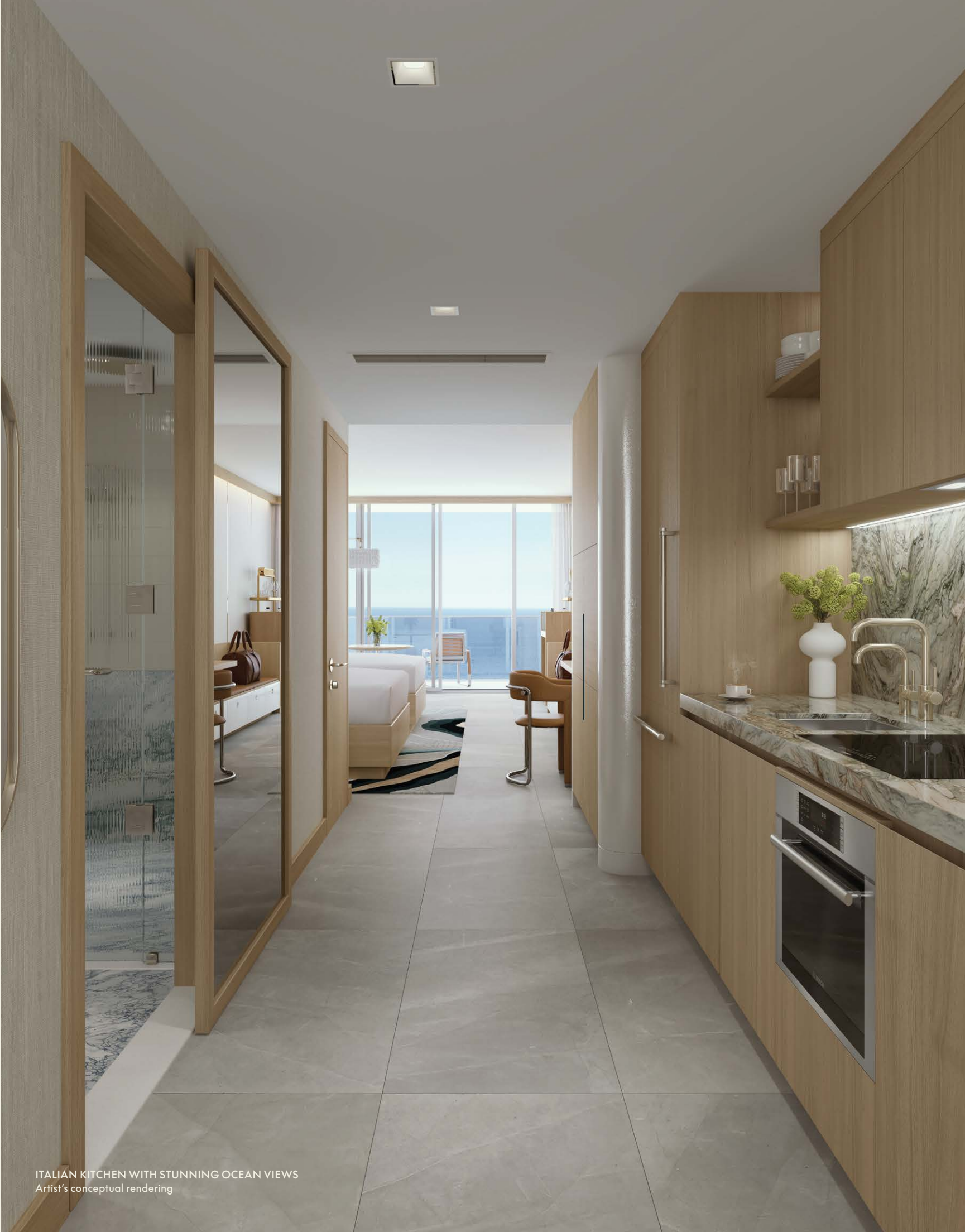
ITALIAN KITCHEN WITH STUNNING OCEAN VIEWS Artist's conceptual rendering