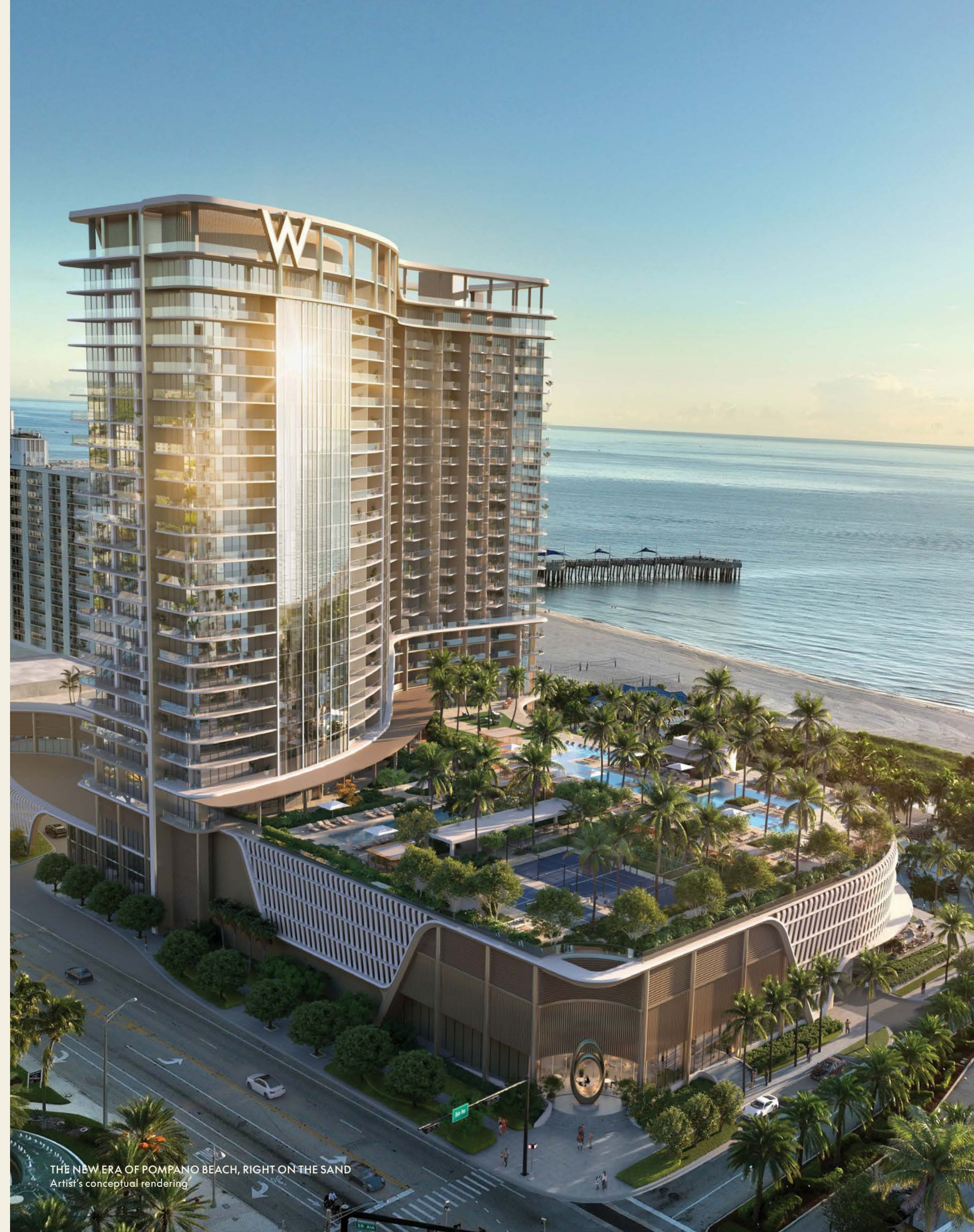
THE NEW ERA OF POMPANO BEACH, RIGHT ON THE SAND Artist's conceptual rendering

*Some of the foregoing may be offered for an added cost.