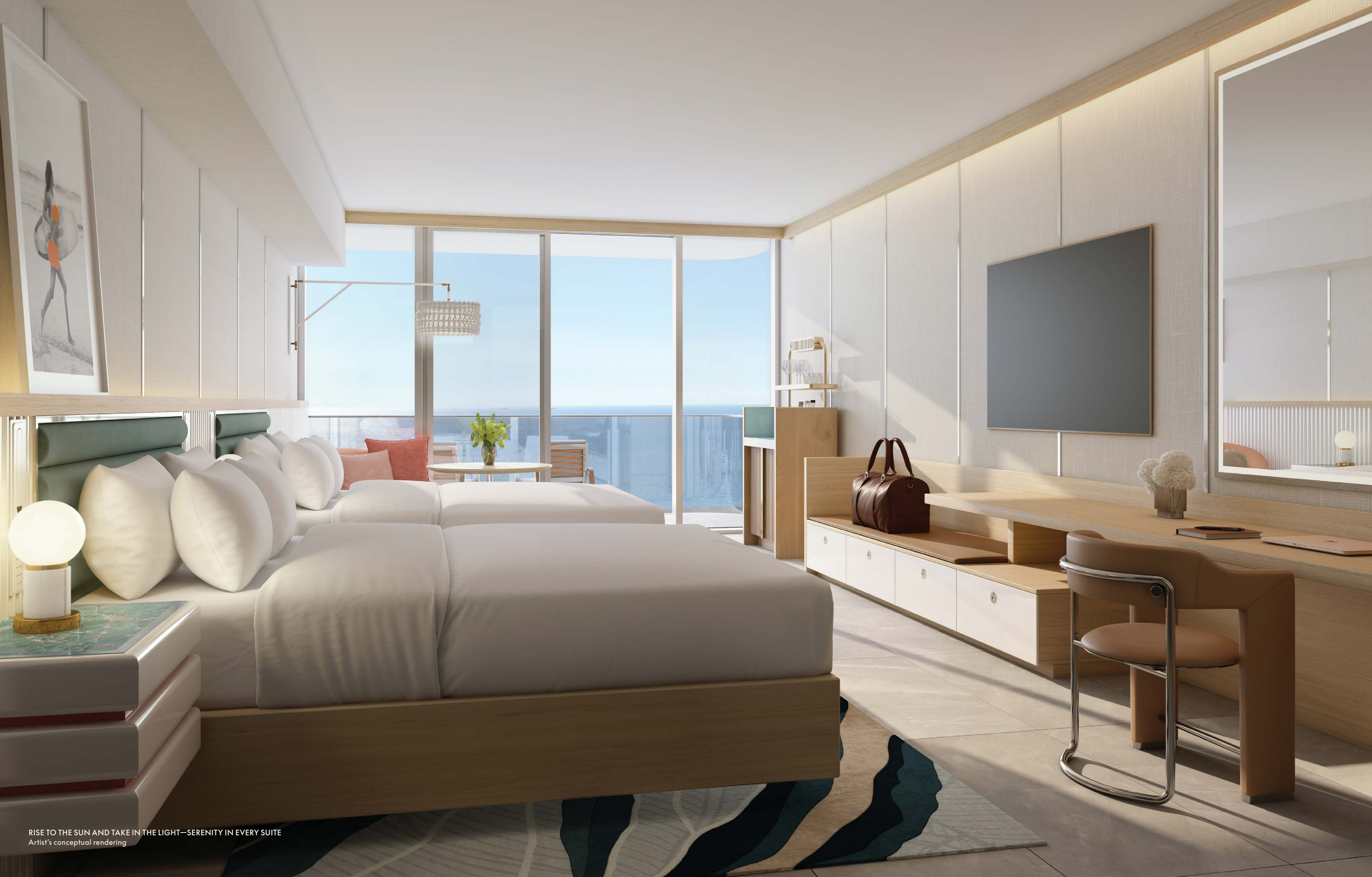
RISE TO THE SUN AND TAKE IN THE LIGHT—SERENITY IN EVERY SUITE Artist's conceptual rendering